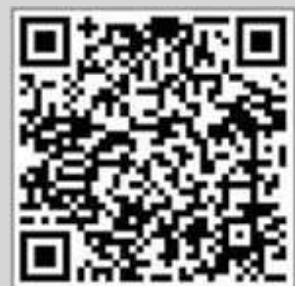
[Supply Chain Edition]

An unauthorized reproduction is published. Otherwise, the offence is punishable.